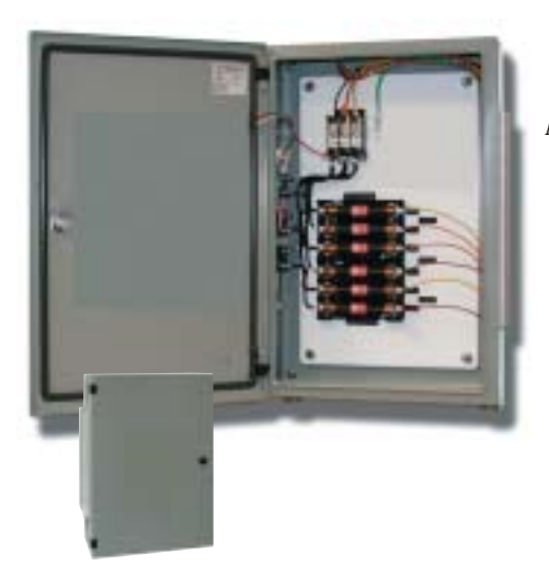
Multi-Zone Analog Controls