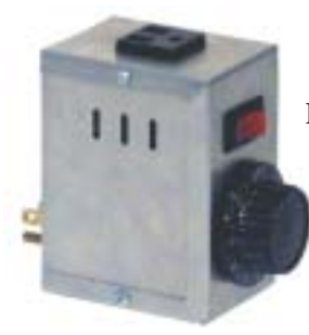
New Plug-In Input Regulators